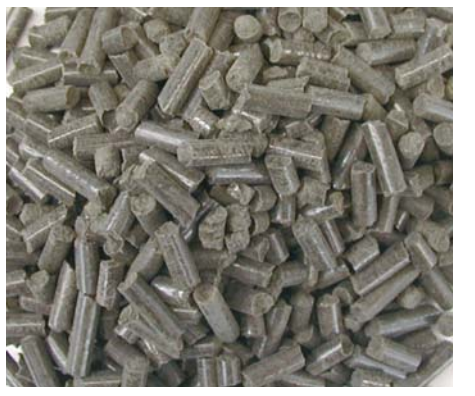
The final products are pellets which are appropriate for a variety of applications.

die pelleting press used by Kahl grinding is effected by means of the cylindrical pan grinder rollers which rotate on the die. For this reason the KAHL pelleting system is particularly appropriate for the above-described product, as it can be adapted without problems to varying organic contents.